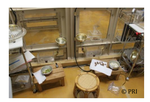
The experimental setup