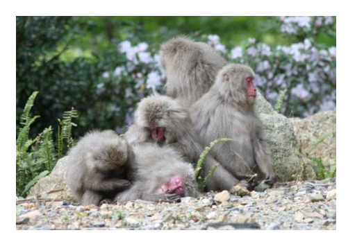
Japanese macaques grooming on Yakushima Island

On March 31, we traveled to Yakushima Island, south of Kyushu. While there we saw many habituated groups of monkeys along with the deer that closely follow them. It was particularly exciting for me to see wild monkeys behaving naturally: foraging, grooming and traveling. Another highlight of the trip to Yakushima was staying in a traditional ryokan, complete with futons, onsens, and traditional meals. In our brief stay on Yakushima, I was truly awed by the beauty and nature present there.