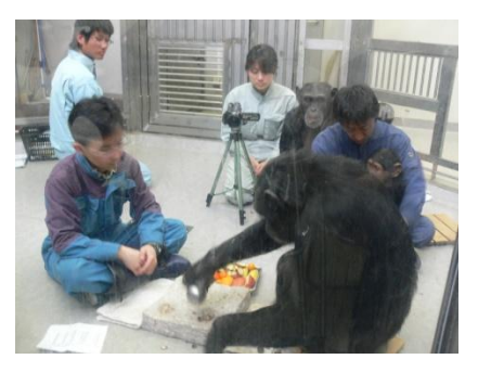
Researchers conducting a nutcracking experiment at GARI

We then traveled to Uto, a sanctuary for chimpanzees formerly used in biomedical research. I really admire the effort the staff and researchers at Uto are putting into improving the welfare of these chimpanzees. While there we saw one chimpanzee's birthday celebration which included an artistically arranged pile of fruit.