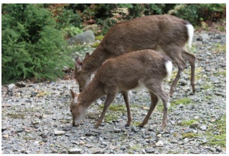
Deer on Yakushima Island