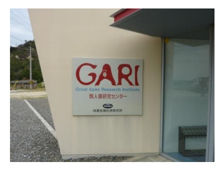
The Great Ape Research Institute

Our second trip was to the Great Ape Research Institute (GARI) and Uto chimpanzee sanctuary from April 5-11, 2010. This trip we traveled with a smaller group, six HOPE-GM students, plus our guides Yumi Yamanashi and Tadatoshi Ogura. We arrived in Uno on the evening of April 5<sup>th</sup> after spending some time in Okayama en route. The next day at GARI we got to explore the amazing chimpanzee enclosure, built right into the side of a hill where chimpanzees can climb, patrol, build nests, and generally spend time in the bushes doing all kinds of natural behaviors. We also saw some chimpanzee experiments, the most impressive of which were those that involved experimenters sitting in the same booth as the chimpanzees and directly interacting with them.