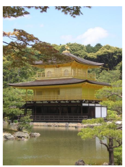
The Golden Temple of Kyoto