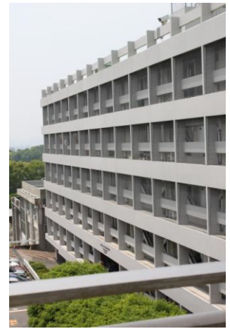
The Primate Research Institute