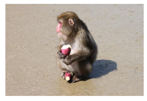
A Japanese macaque with sweet potatoes on Koshima

On March 31, we traveled to Yakushima Island, south of Kyushu. While there we saw many habituated groups of monkeys along with the deer that closely follow them. It was particularly exciting for me to see wild monkeys behaving naturally: foraging, grooming and traveling. Another highlight of the trip to Yakushima was staying in a traditional ryokan, complete with futons, onsens, and traditional meals. In our brief stay on Yakushima, I was truly awed by the beauty and nature present there.