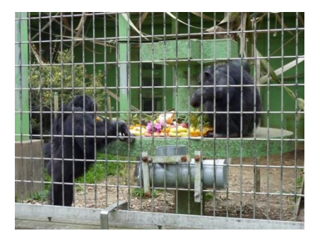
A chimpanzee birthday celebration