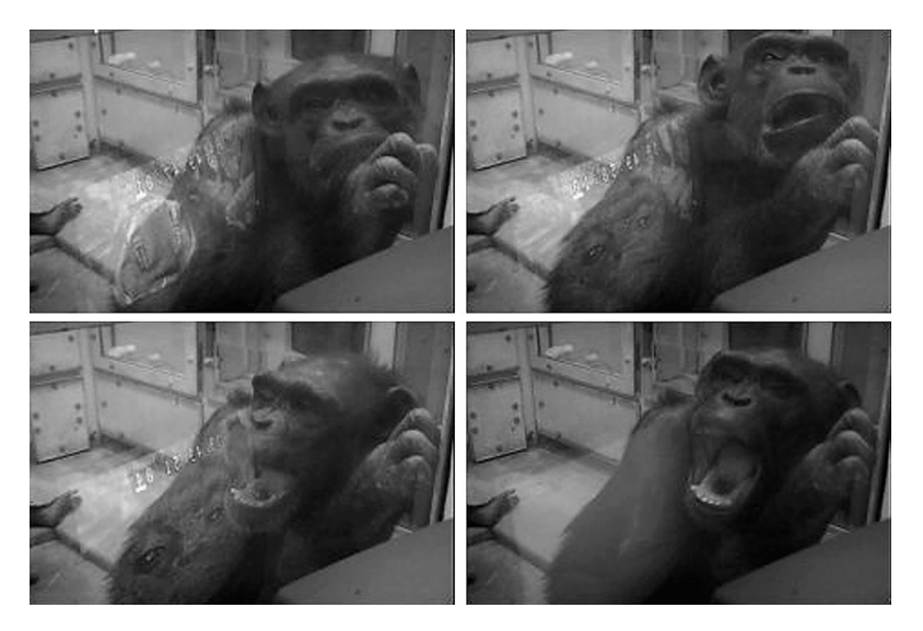
Figure 1. A yawn response during presentation of a yawn videotape. Ai watches a yawn on the screen (top left), starts to yawn as the stimulus yawn ends (top right), continues to yawn (bottom left), and completes the yawn while the screen is blank (bottom right). See electronic Appendix A.